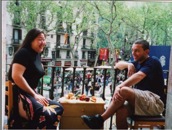
The joint venture discusses future plans at Las Ramblas in Barcelona.

Client: United Airlines. Chicago, IL Client Contact: www.ual.com Project: Travels in Europe. Services: Main Consultant, Analyses and Numerical Modeling of sites, restaurants, hotels, train stations and toilets.