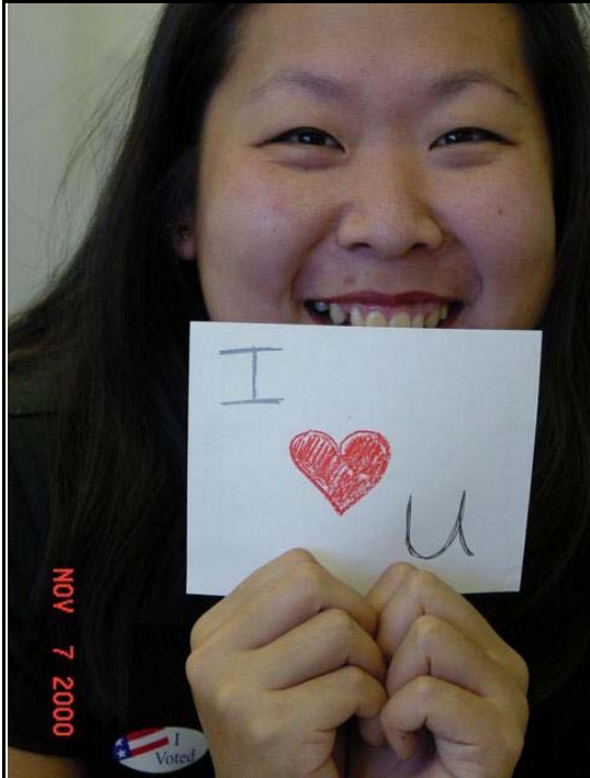
Construction of the redwood branch fence for privacy and canine containment took its toll on the joint venture. Agghh, it could be a picture of a fence!